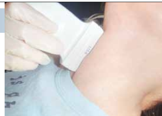
Thyroid ultrasound is now available at our Testing Center on Pre-Emption Road in Geneva.

Finger Lakes Medical Associates Testing Center now offers thyroid ultrasound evaluation to aid in the diagnosis and proper treatment of thyroid disease. For more information, ask your physician or call us at